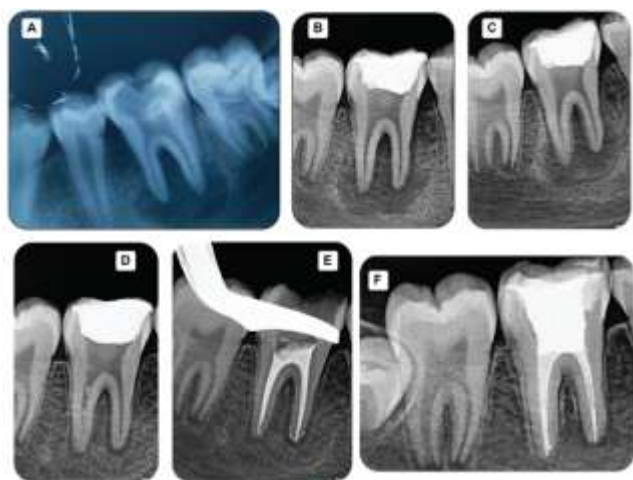
Fig. 3 A- F: A. Preoperative radiograph; B. 1 week follow up radiograph; C. 3 Week follow up radiograph; D. 3 Month follow up radiograph; E. 3 month follow up radiograph after thermoplasticized obturation; F. 1 year follow up (Case report 2)

The paste was changed every 2 weeks for a period of 3 months. 1 week following placement the medication the patient remained asymptomatic. After 3 month, radiograph revealed complete healing with well-defined trabecular pattern. Obuturation completed with thermoplastisized obturation technique during that visit. 1 year review shows perfect healing in the periapical area.