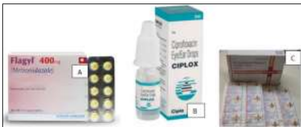
Fig. 1 A-C (Components of preparation) A – Flagyl 400mg; B. Ciplox eye drop; C. Dexona 0.5 mg

The canals were dried with sterile paper point and then medicament were palced into the canal using lentulospiral and H files. Access cavity were sealed with Cavit with cotton pellet beneath the restoration. Patient reviewed after 1 week. Swelling and Symptoms completely subsided. Cleaning and shaping repeated with proper irrigation with 3% sodium hypochlorite and MAS paste given as intra canal medicament. Patient recalled after 2 week. Canals were cleaned with 3% sodium hypochlorite and final rinse of 17% EDTA were given followed by normal saline. Canals were dried using paper points, and obturation of 41 and 31 completed using lateral condensation technique. Obturation of 32 and 42 completed in the next visit after 1 week. Access cavities of all the root canal treated tooth were sealed with GIC. Patient recalled after 3 months and 1 year interval. The clinical and radiographic examination demonstrated that patient was asymptomatic, and the tooth exhibit proper integrity of periapical and periodontal tissue after 1 year.