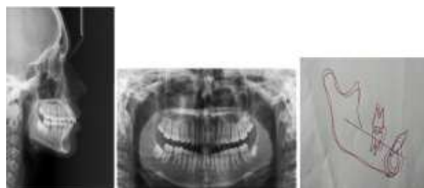
Fig.7: Post treatment radiographs and superimposition

The posttreatment cephalometric measurements (Fig. 7) revealed favorable sagittal skeletal changes. A mandibular advancement was clearly evident as ANB angle was reduced attaining a Class I skeletal profile.