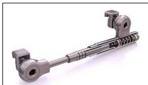
Fig 1: POWERSCOPE

Power Scope (Fig. 1) is the latest innovation in Class II correction which is a direct derivative of the Herbst Type II appliance. 1,2 Dr. Andy Hayes worked in conjunction with American Orthodontics to develop Power Scope. Its unique features are patient-friendly design, ready to use one piece with no laboratory setup and no assembly. It has a simple attachment system with durable telescopic mechanism, a Ni-Ti internal spring system which reduces the treatment time compared to the other Class II correctors and a ball and socket joint system which maximizes lateral movement for patient comfort.