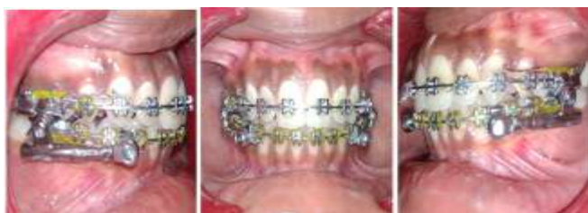
Fig. 5: With power scope

Power Scope (Fig. 5) was placed between the upper and lower arch for placing the mandible forward to improve patient’s profile. Because it is worn full-time, it does not depend on patient cooperation. Fixed functional therapy was completed with a duration of 6 months. Entire treatment time was 1.5 years