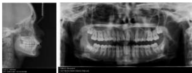
Fig. 4: Pretreatment radiographs

Cephalometric analysis (Fig. 4) revealed a convex skeletal profile with ANB angle of 5°, a retruded mandible, and a well-positioned maxilla. Dentoalveolar readings suggested proclined upper anterior teeth while the lower incisors were properly inclined. The panoramic radiograph revealed the presence of all permanent teeth with erupting third molars.