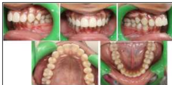
Fig. 3: Intraoral photographs

Intraoral examination (Fig. 3) revealed a Class II, Division 1 malocclusion with an overjet of 8 mm and an overbite of 5mm, with a coinciding upper and lower dental and skeletal midline.