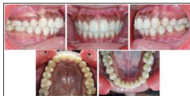
Fig. 6: Post treatment extra oral and intra oral photographs

The posttreatment cephalometric measurements (Fig. 7) revealed favorable sagittal skeletal changes. A mandibular advancement was clearly evident as ANB angle was reduced attaining a Class I skeletal profile.