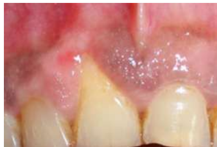
Fig. 4: Post-operative photograph 15 days after surgical removal.