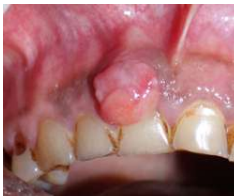
Fig. 1: Solitary gingival growth irt 11.

removed. Surgical intervention of POF should ensure deep incision of lesion including periosteum. Due to increased recurrence rates regular follow up is essential. Incomplete excision of lesion and/ or due to perseverance of local factors is the possible reason for recurrence. Recurrence rates have been reported from 7% to 45%. 18,4