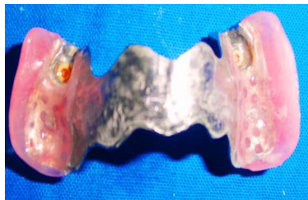
Fig. 7: CPD Intalagio surface with 'O' ring

The metal copings were clinically examined and the marginal fit was verified. Keeping the metal copings on the prepared teeth an pick up impression was made with monobody elastomeric impression material. An adequate interocclusal distance allowed ceramic application (Fig. 6). The dental surveyor was again used to check the previously established insertion/removal path of the CPD. The FDP/cast assembly was duplicated with reversible hydrocolloid, and a refractory cast was produced. Single palatal strap major connector was designed. The artificial teeth were selected and positioned using the interim prostheses as form and color reference (Fig. 7 & 8). O-Ring is held into the denture base acrylic (matrix portion) by a metal ring. This allows for ease in replacement of the rubber O-Rings if they are worn out in the future with minimal damage. To ensure adequate seating during FDP cementation, the prostheses were attached extraorally, and glass ionomer cement was used. This procedure must be carried out when attachments are used for the association of an FDP/RPD, because a minimal error during FDP cementation may compromise the oral rehabilitation. (Fig. 9)