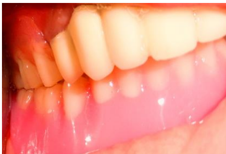
Fig. 11: complete prosthesis insitu