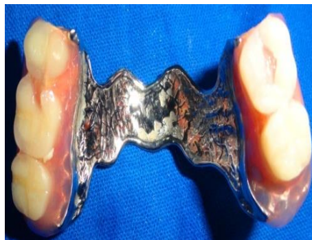
Fig. 8: CPD Occlusal surface