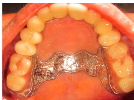
Fig. 9: FPD with Precision Attachments