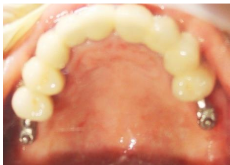
Fig. 6: FPD with Patrix component

The metal copings were clinically examined and the marginal fit was verified. Keeping the metal copings on the prepared teeth an pick up impression was made with monobody elastomeric impression material. An adequate interocclusal distance allowed ceramic application (Fig. 6). The dental surveyor was again used to check the previously established insertion/removal path of the CPD. The FDP/cast assembly was duplicated with reversible hydrocolloid, and a refractory cast was produced. Single palatal strap major connector was designed. The artificial teeth were selected and positioned using the interim prostheses as form and color reference (Fig. 7 & 8). O-Ring is held into the denture base acrylic (matrix portion) by a metal ring. This allows for ease in replacement of the rubber O-Rings if they are worn out in the future with minimal damage. To ensure adequate seating during FDP cementation, the prostheses were attached extraorally, and glass ionomer cement was used. This procedure must be carried out when attachments are used for the association of an FDP/RPD, because a minimal error during FDP cementation may compromise the oral rehabilitation. (Fig. 9)