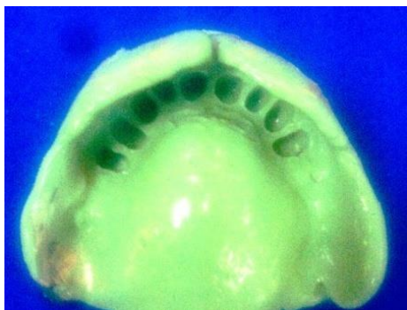
Fig. 4 : Final impression with light body elastomer

The dislodged prosthesis was removed with crown remover. (Fig. 3) After nonsurgical periodontal therapy and analysis of the diagnostic casts mounted on a semi-adjustable articulator, treatment planning consisted of a maxillary rehabilitation by means of an association between tooth-supported FDP (maxillary first premolar