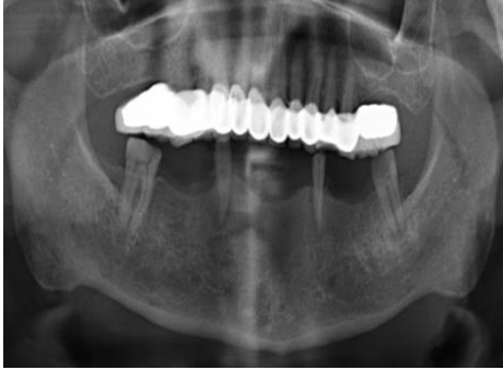
Fig. 1 : Pre OPG showing cantilever FPD