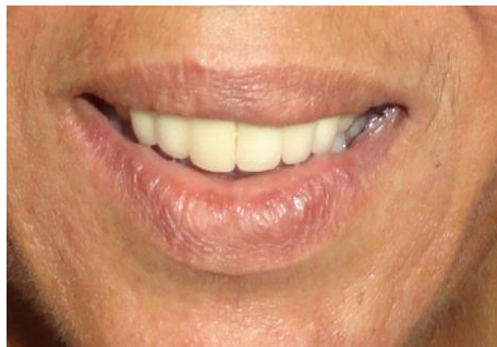
Fig. 12: Frontal Smile

Once the maxillary rehabilitation is done mandibular lower conventional denture was processed. Final impression was made with Light body elastomeric impression material. (Fig. 10) Bite registration was done and teeth arrangement was done. Final prosthesis was given. (Fig. 11) The patient received hygiene and care instructions in writing and learned how to take care of his prostheses. During 1and 2week control appointments, and after 6, 12 months follow-up, an enhanced esthetic appearance and improved retention could be observed. (Fig. 12)