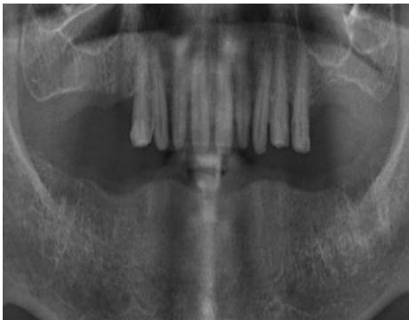
Fig. 2: Post OPG after removal of cantilever FPD