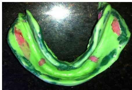
Fig. 10: Lower Final Impression