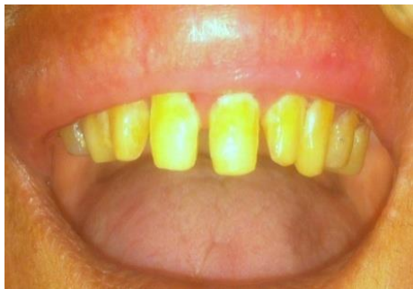
Fig. 3 : Pre operative view