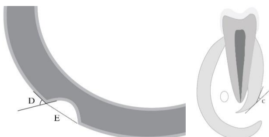
Fig. 2: (C) Angulation of mental canal in the coronal view. (D) Angulation of mental canal in the axial view. (E) Width of the foramen

Descriptive and inferential analysis was performed using SPSS Statistics 21.0 (SPSS Inc. Chicago, IL) for Windows. A critical value of P < 0.05 were considered statistically significant. Ethical approval was obtained from the Ethical Committee of the College of Dental Medicine in the University of Sharjah.