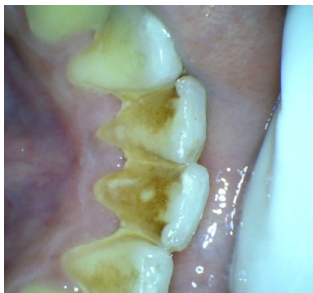
Fig. 1: This picture with stains & calculus depicts the poor oral hygiene.