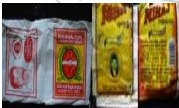
Fig. 3: Without statutory warning