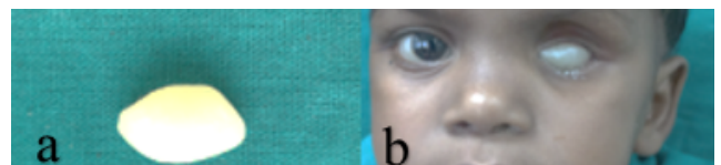
Fig. 3: a. Wax pattern for trial, b. Wax pattern tried in patients eye