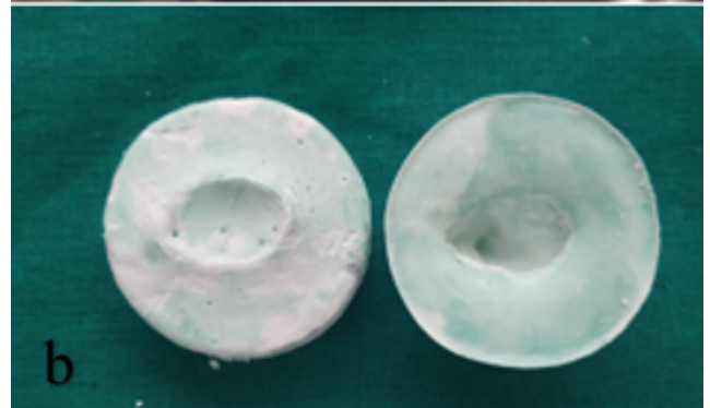
Fig. 2: a Impression made using light body Addition silicone, b stone model made