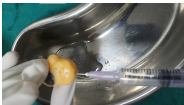
Fig. 3: Final prosthesis removing salt through saline-filled in syringe by making holes in final prosthesis.