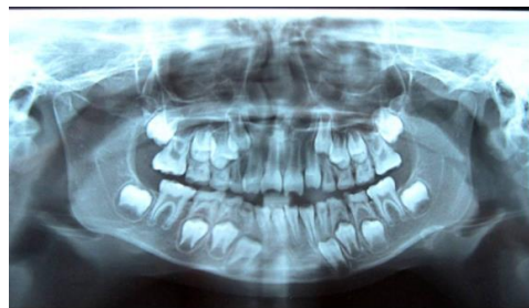
Fig. 3: Orthopantomogram revealed less contrast between enamel and with loss of enamel at occlusal surface and incisal edges..