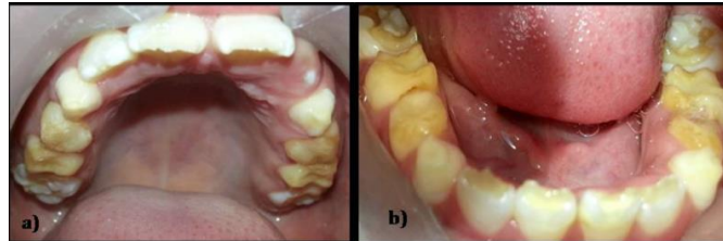
Fig. 2: a) Intraoral view of maxillary arch showing presence of mottled enamel b) Intraoral view of mandibular arch revealing mottled enamel on occlusal surfaces and proximal caries in 74, 75 .