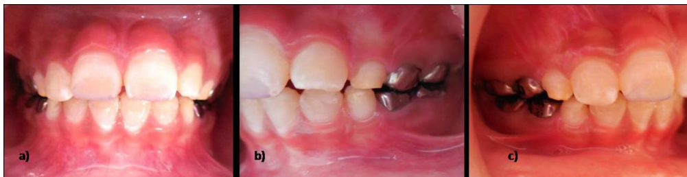
Fig. 4: a) Esthetic correction done conservatively by composite restorations in 11, 21, 12, 31, 32. b,c) Stainless steel crowns on deciduous molars restored clinical vertical heights of crown.