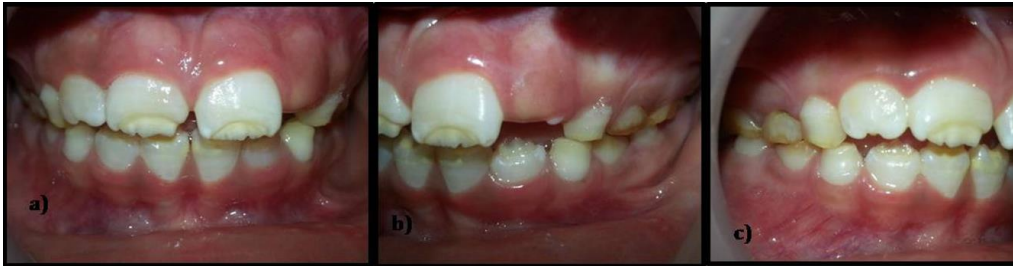
Fig. 1: a) Frontal view in occlusion revealing chipped enamel in permanent incisors b,c) Right & left lateral view in occlusion respectively.