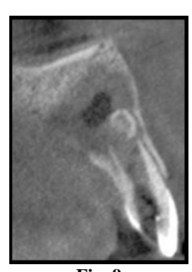
Fig. 9 Fig. 5-9: Cone Beam Computed Tomography: Destruction of the palatal cortical bone