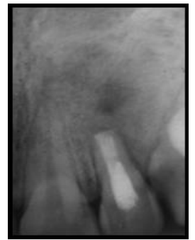
Fig. 23: 12months follow-up

Case 2: A girl aged 9 years, reported to our dental department with history of traumatic injuries to maxillary central incisors. The teeth were diagnosed to be non-vital with a combination of clinical signs, vitality tests and radiographs. It had an open apice and periapical radiolucency. (Fig. 24) The teeth were