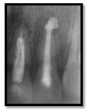
Fig. 27: 12 months follow-up