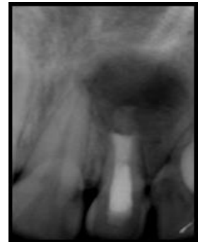
Fig. 11: An apical plug approximately 4mm thickness & obturation of the rest of the canal with gutta percha

Small pieces of ETIK collagen (Acteon Pierre Roland) were packed against the bone into the periapical defect in order to create a matrix for the placement of MMTA (MicroMega). The MMTA was compacted against the barrier with pluggers to create an apical plug approximately 4 mm thickness. The rest of the canal was filled with flowble Gutta Percha(system QUIRLESS) and the coronal cavity was sealed with Cavit (3M ESPE AG, Seefeld, Germany). A radiograph confirms the obturation of the totality of the canal. (Fig. 11)