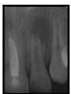
Fig. 24: Preoperative radiograph: an open apice & periapical radiolucency

The mother of patient was informed about the extrusion. The follow up demonstrated that the patient functioning well with no reportable clinical symptoms and the radiograph after one year showed that the periapical lesion is on going healing. (Fig. 27)