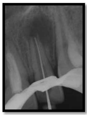
Fig. 25: Working length radiograph