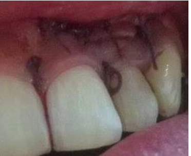
Fig. 20: The flap was sutured