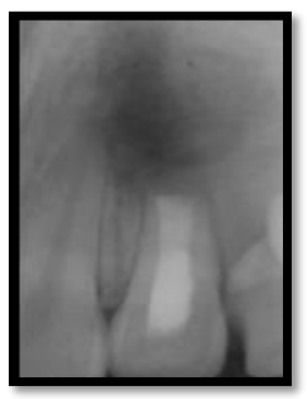
Fig. 21: 3months follow-up