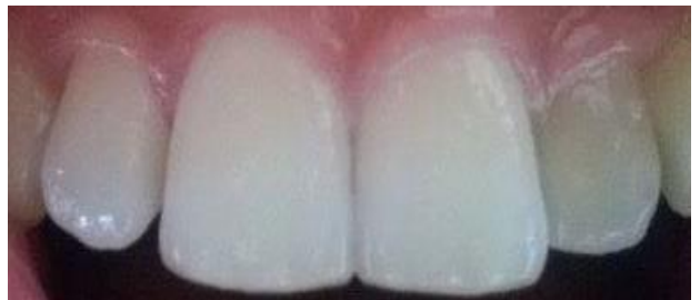
Fig. 1: Clinical view (discolored upper left lateral incisor)

Case 1: A 27-year-old girl with a non-contributory medical and familial history consults our department of dentistry with a recurrent abscess and fistula in her upper left vestibule. Clinical examination revealed discolored upper left lateral incisor (Fig. 1).