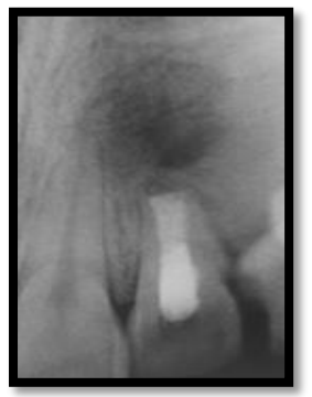
Fig. 22: 6months follow-up