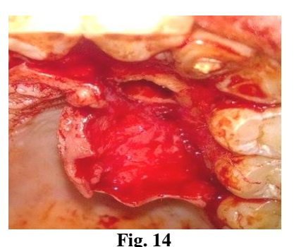
Fig. 14 Fig. 13, 14: Soft tissues attached in the internal surface of the flap corresponding to the cystic lesion was collected

Then, the flap tissues and periostum were retracted (full-thickness flap), and the bone exposed. The soft tissues attached in the internal surface corresponding to the cystic lesion was collected (Fig. 13, 14), but we noticed there is more infected tissues attached to the buccal cortical bone so another full-thickness flap was done between teeth number 21 and number 23(Fig. 15). Using a low speed 0.8cm trephine, a circular osteotomy was performed and the rest of the tissues was enucleated (Fig. 16, 17). A communication between the two bone defects was noticed (Fig. 18). We could see