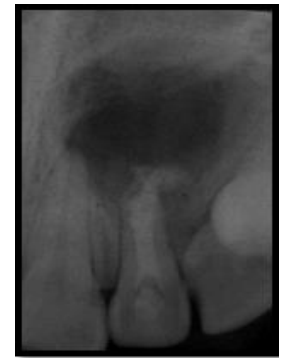
Fig. 10: The canal was filled with calcium hydroxide pase (Metapaste, Meta-Biomed) & the access cavity was temporary sealed with Cavit (3M ESPE AG, Seefeld, Germany)

Small pieces of ETIK collagen (Acteon Pierre Roland) were packed against the bone into the periapical defect in order to create a matrix for the placement of MMTA (MicroMega). The MMTA was compacted against the barrier with pluggers to create an apical plug approximately 4 mm thickness. The rest of the canal was filled with flowble Gutta Percha(system QUIRLESS) and the coronal cavity was sealed with Cavit (3M ESPE AG, Seefeld, Germany). A radiograph confirms the obturation of the totality of the canal. (Fig. 11)