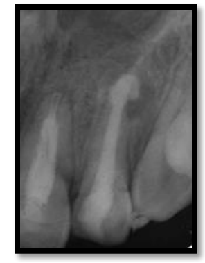
Fig. 26: Post-operative radiograph: extruded MTA on the periapical lesion