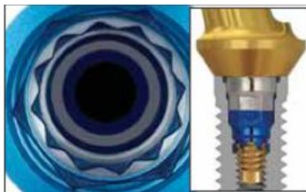
Figure 3: 12 point internal connection Source: June 2017, volume: 1, issue: 3 Karnataka Prosthodontic Journal

While offering enhanced flexibility in abutment positioning, the 12-point internal hexagon design must maintain strong mechanical properties at the implant-abutment interface. Studies using finite element analysis have shown that implant systems like the reduced-diameter 3i Implant System with a 12-point double internal hexagonal connection exhibit superior stress distribution and minimal displacement compared to other designs, such as those with external hexagonal connections like the Brånemark system. 10