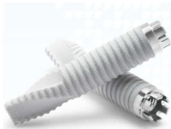
Figure 2: Spline implant

However, the spline connection's narrow diameter implants lack stability and may experience spline fractures. Available in 4, 5, and 3.25 mm diameters, the 4 and 5 mm implants offer strong mechanical stability and reduced incidence of screw loosening. In contrast, the 3.25 mm diameter implant, with its smaller splines and narrow platform, has a frail interface, making it less popular due to its vulnerability. 16