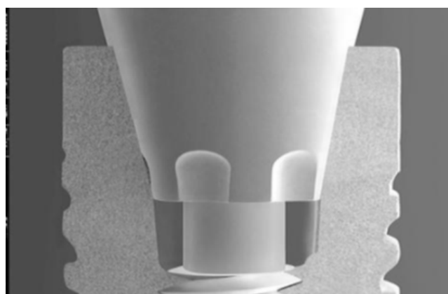
Figure 5: Morse taper

Sutter et al. proposed the Morse taper connection as an optimal combination of predictable vertical positioning and self-locking characteristics. Norton supported this by showing that conical connections between implant and abutment significantly enhanced the system's resistance to bending forces. Further studies by Levine et al. and Felton confirmed reduced complications, such as abutment screw loosening, with Morse taper connections compared to external hex connections. 24