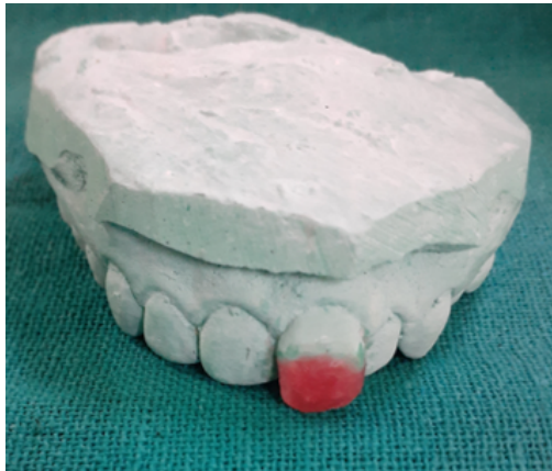
Fig. 6: Showing wax build up of fractured segment