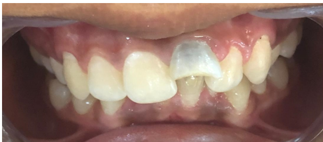
Fig. 1: Showing fractured tooth with black discolouration

The unsupported enamel was removed via 45 degree bevel. Preliminary impressions of both the arches were made and study models were made in dental stone and mock preparation of the lost tooth structure with modeling wax was done. After crown build up, the cast was duplicated by using template of putty impression material. Labial surface of the putty template was removed up to middle third of the crown, to aid in the reconstruction of the lost tooth structure. A clinical try-in of the template was done to ensure adequate fit. After appropriate shade selection of the composite material, the build-up was done to restore the fractured teeth quickly with minimal post-restoration finishing.