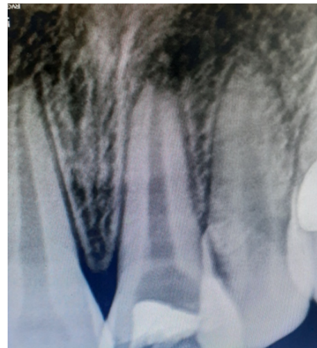
Fig. 3: Showing removal of needle