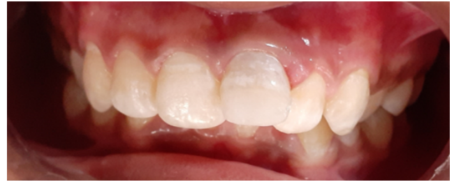
Fig. 9: Showing post build up

time that has elapsed since the foreign body was inserted in to the root canal. The removal of foreign objects is sometimes difficult and the success rate has been reported to be 55% to 79%.