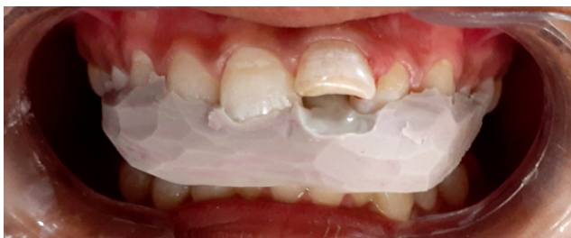
Fig. 8: Showing putty impression as a template in mouth