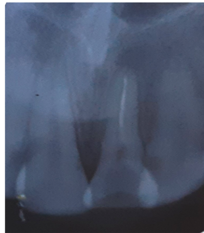
Fig. 2: Showing presence of needle obstruction in canal

If the root canal is open, the patient may try to clean the obstructing food substances from the canal with various objects that may break and get lodged in the pulp space. Foreign objects in the root canal can be a source of infection and should be removed. This may sometimes be very difficult because of the shape, size and position of the foreign body. The degree of difficulty depends also on the