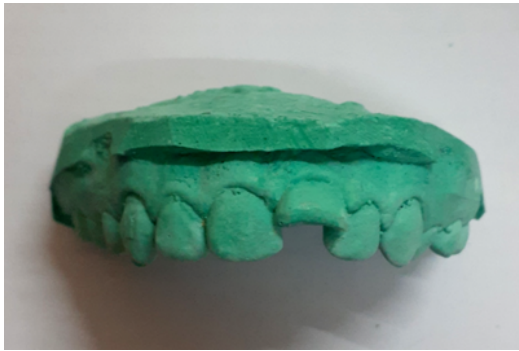
Fig. 5: Showing study models prepared