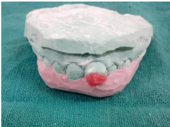
Fig. 7: Showing putty impression as a template n cast