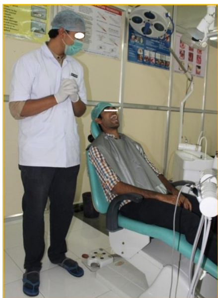
Fig. 2a): Chair Position for Mandibular Extractions.