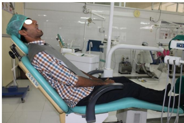
Fig. 1b): Chair Position for Maxillary Extractions.